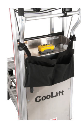
leverage for maneuvering uneven tailgates and terrain.