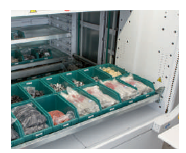
SINGLE INTERNAL DELIVERY

Internal or External Bay, Single or Dual Delivery