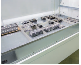
DUAL INTERNAL DELIVERY