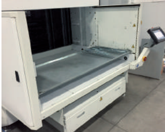
SINGLE EXTERNAL DELIVERY