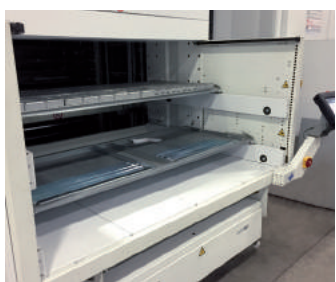
DUAL EXTERNAL DELIVERY