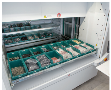
SINGLE INTERNAL DELIVERY SINGLE EXTERNAL DELIVERY DUAL INTERNAL DELIVERY

Dual delivery is the ideal configuration for a fast-paced picking operation.