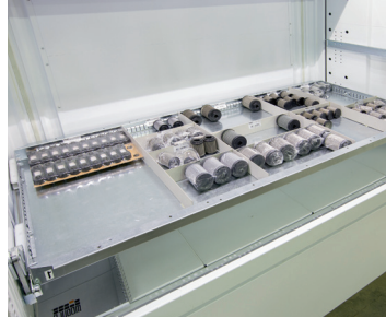
DUAL EXTERNAL DELIVERY