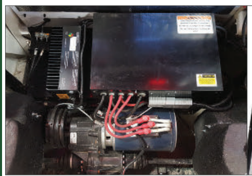
The GO-4 EV is powered by a 55 peak HP (41kW) 3 phase AC motor. 96 Volt Lithium Ion Battery pack. 110 or 220 V charging.