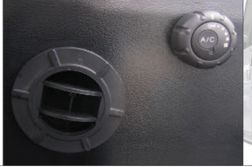
Optional AC is available, as well as a lateral thrust alarm which notifies the driver if taking a corner too quick and tight.