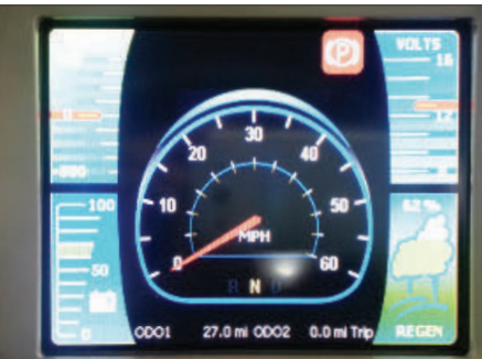
EV - Standard fully digital center dash display. Main displays are speed, AMPS, battery charge, Volts, hour meter, and odometer.