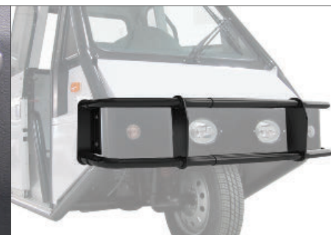
Additional nerf bar option for reducing impact from any potential dents and collisions.