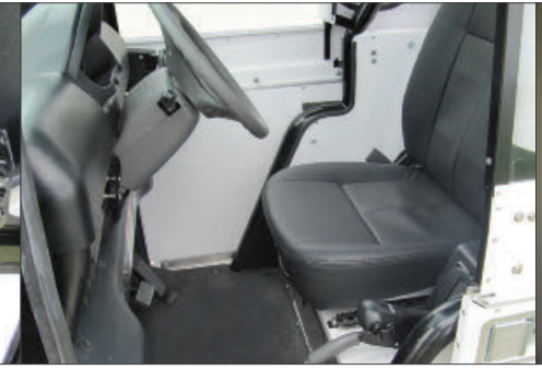
A comfortable interior offers an adjustable sliding chair, tilt steering, excellent viewing conditions, and optional cup holder arm rest.