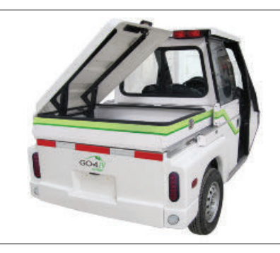
Rear trunk with hinged and locking lid provide extra storage space.