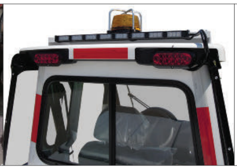
LED lighting is now a standard feature on the GO-4, for all exterior lighting other than the head lights. Lighting is also positioned up high on the rear cab to easily notify vehicles of frequent stopping. Additional béacons can be added.