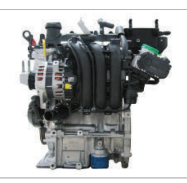
The GO-4 is powered by the latest and most efficient Hyundai / Kia power plant. 3 cylinder, 69 horsepower, 4 speed automatic transmission.